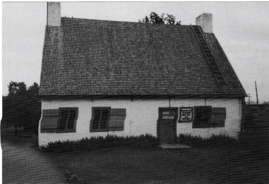
Nicolas Belanger's house at 600 Avenue Royale, Beauport