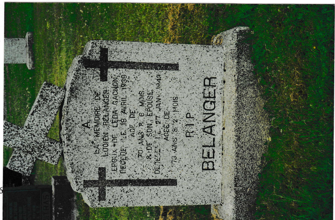
Chapter 11, Page 6

Grandpa's blacksmith shop had a woodworking shop in the back, which he rented out. I have a small end table that was made in that shop before it was torn down. The original blacksmith shop was built right next to the old homestead until a new shop was built and the original taken down. The old homestead was later to become Uncle Dollard's home. Grandma and Grandpa had a camp at Salmon River and all of us kids enjoyed going there.